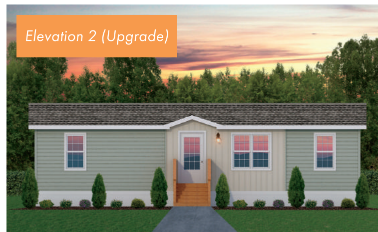
Elevation 2 (Upgrade)

14 Industrial Drive, Sussex, NB, E2E 2R8 1-888-433-9130 | info@prestigehomes.ca prestigehomes.ca