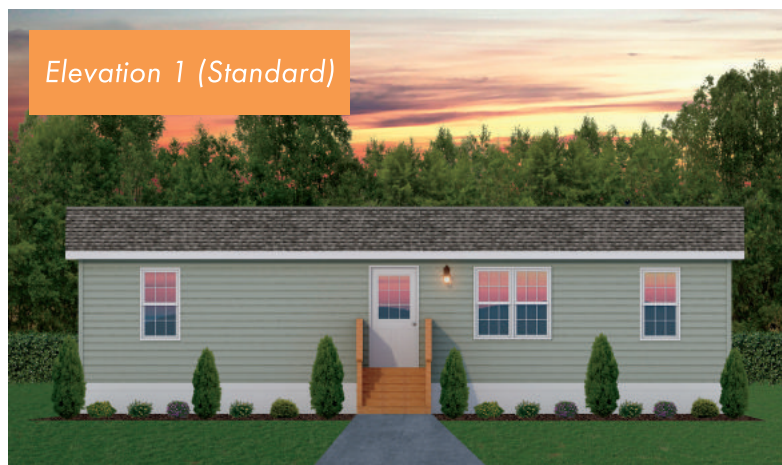
Elevation 1 (Standard)

Details are subject to change without notice.